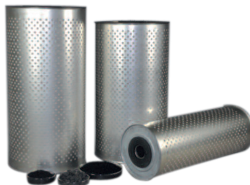
Magnified activated carbon